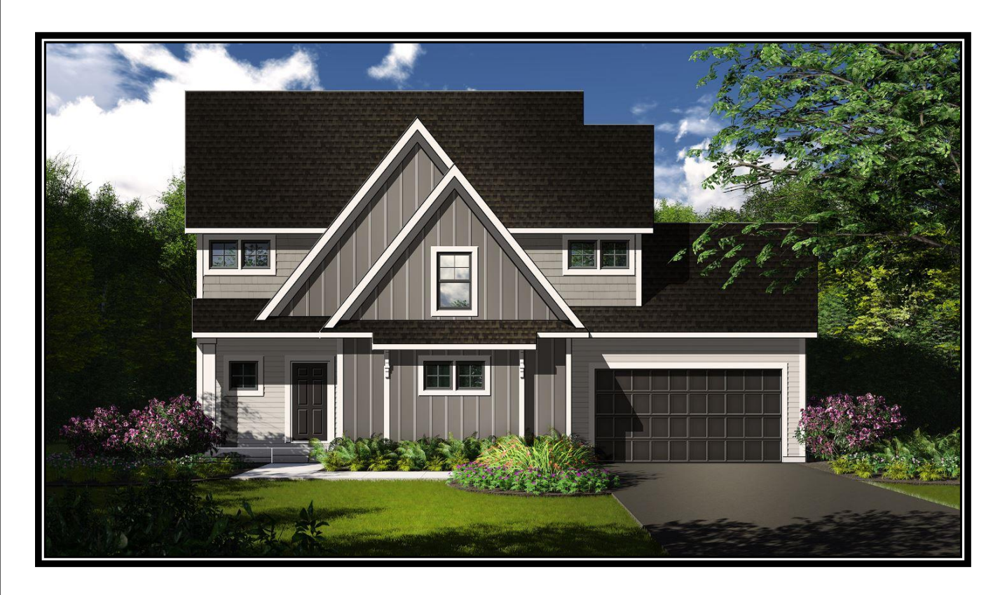
Elevation A 2,308 finished square feet

3 Bedrooms | 2.5 Bathrooms | 3 Car Garage