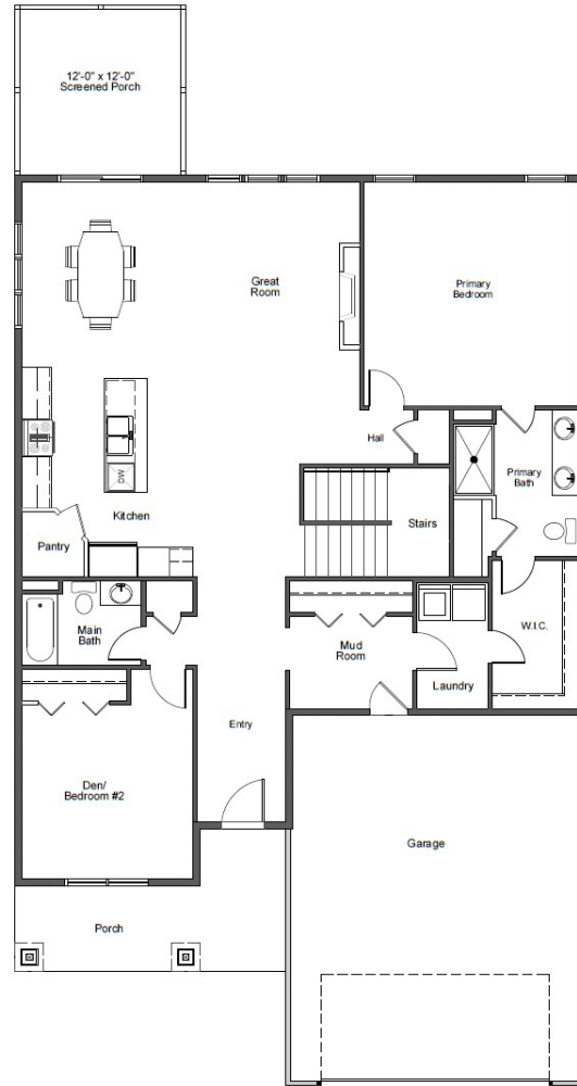
Main Floor Layout